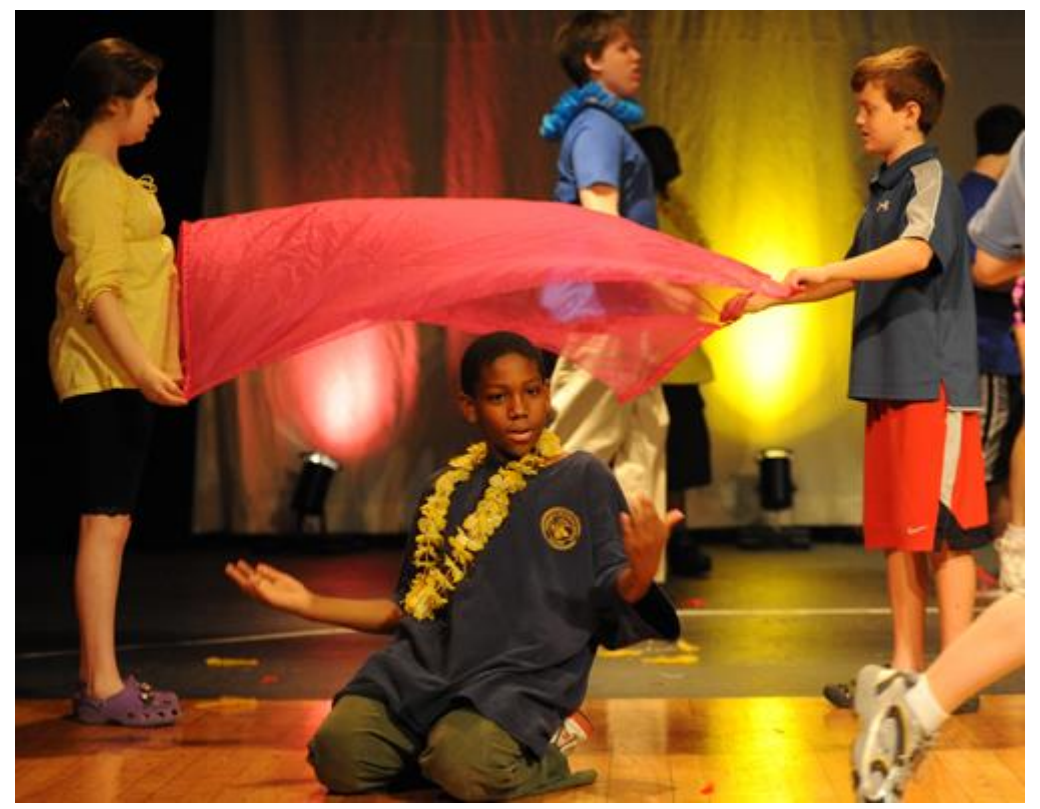
Figure 1: Drama sessions for Children