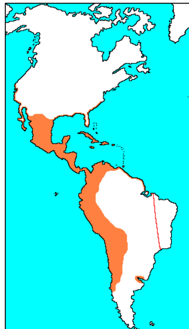
Source J: Map showing the Spanish colonies in the New World in c.1550