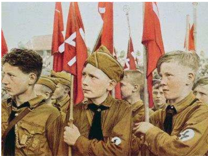
Source M: Photo of young people in an official group during a German Nazi rally

6. Note carefully the following sources on authoritarian governments between the wars and then answer the questions that follow.