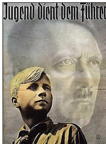
Source N: Poster 'Jugend dient dem Führer' (English translation: 'The Youth serve the Führer')