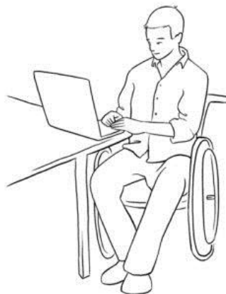
Figure 5: Adolescent