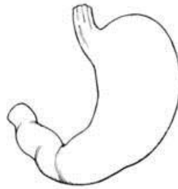
Figure 4: Stomach