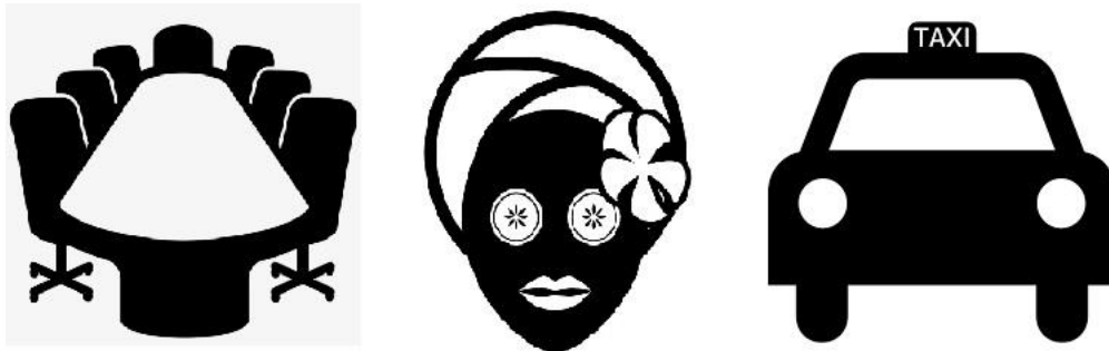
Figure 1: Services provided by the business