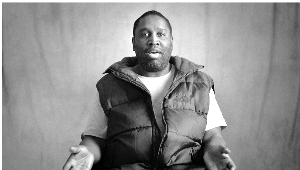
Photograph 1:

b. Identify the different types of shots used in the following photographs: