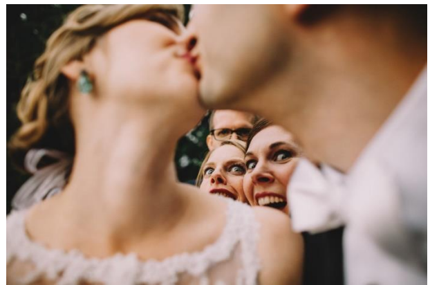
Figure 8: