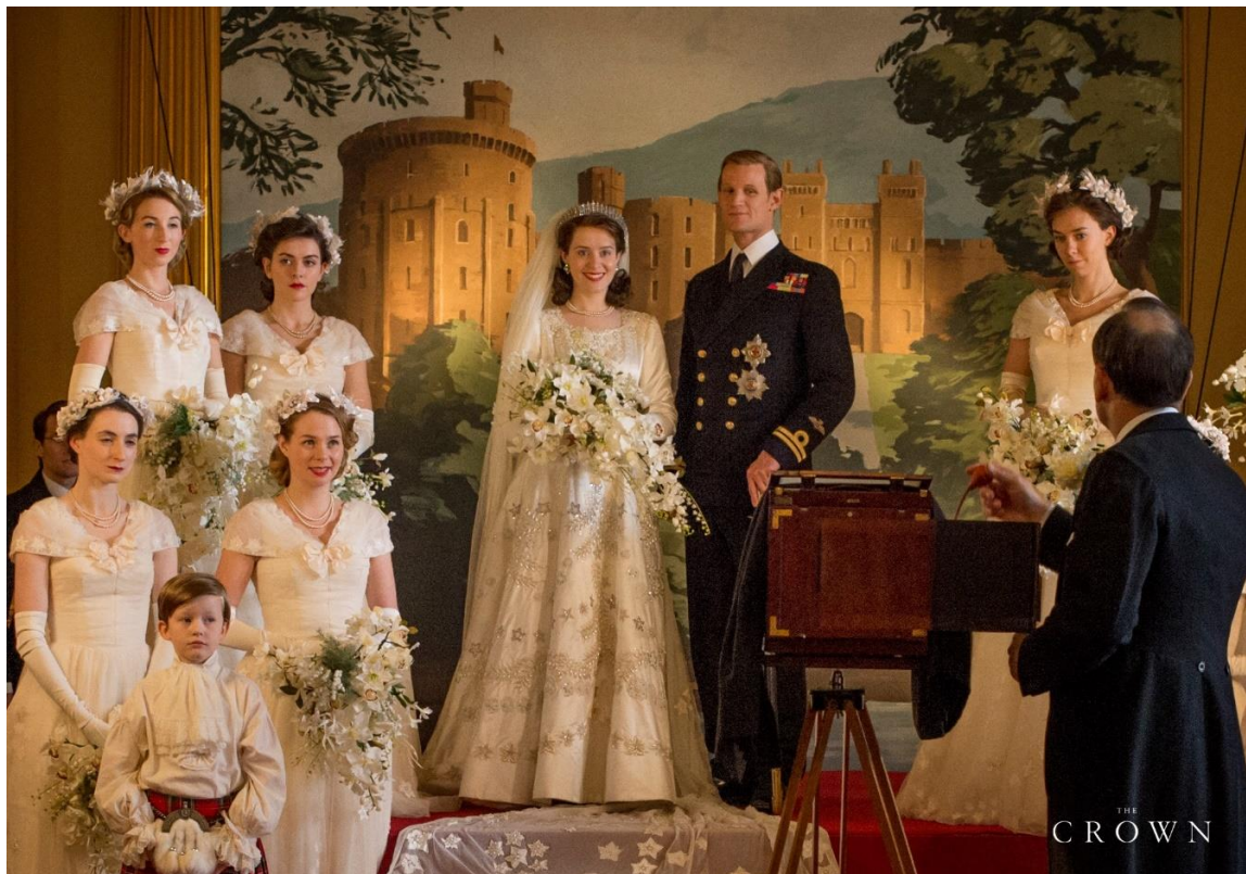
Figure 5: The Crown

c. Refer to the following image from the series "The Crown" showing the wedding of Queen Elizabeth II.