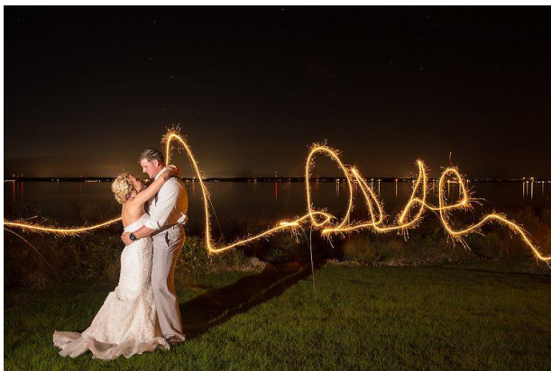
Figure 7: