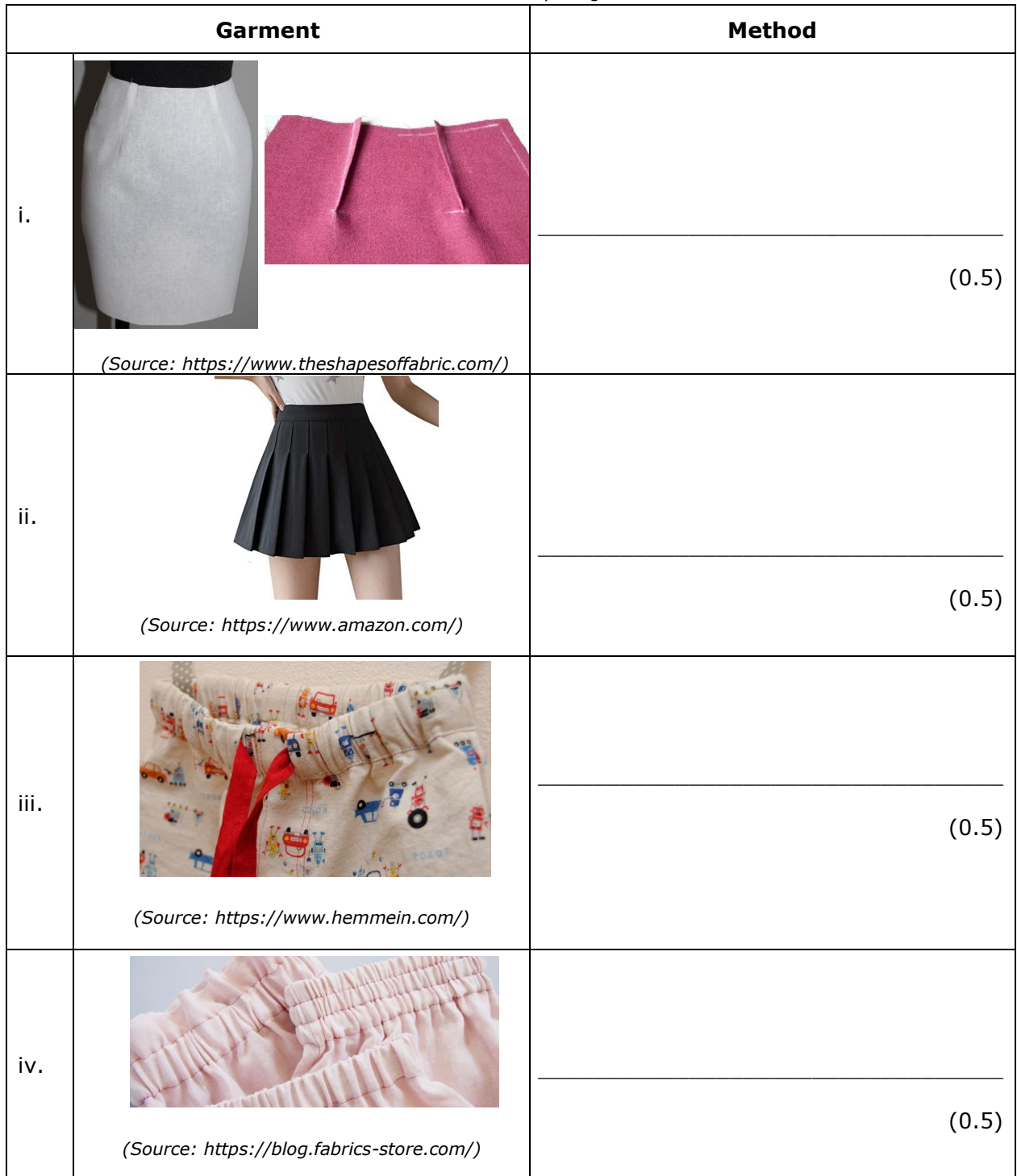
Table 3: Methods of disposing fullness

b. Label the FOUR methods of disposing of fullness on a skirt or a trousers shown in Table 3.